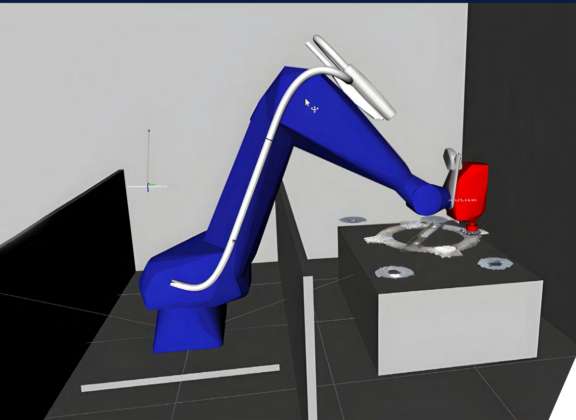
Virtual representation of ROS-based production system

Not long ago, it was thought that the primary focus of a ROS-Industrial project was just to drive engagement in the idea that open-source software could be used for industrial robotic applications. This goal has not only been realized, but it could be considered that open-source capability has laid the foundation for the acceleration of some of the most compelling advanced robotics capability emerging from the sector.